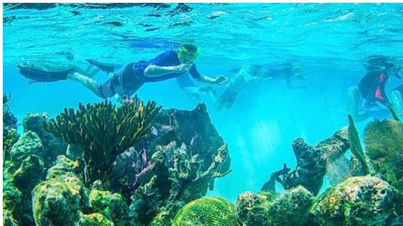
Add a Few Days and Visit The Barrier Reef to Snorkel!