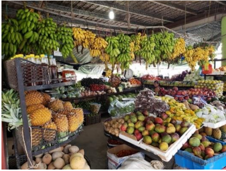
San Ignacio Open Market