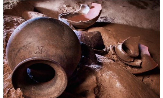
Belize Botanic Garden